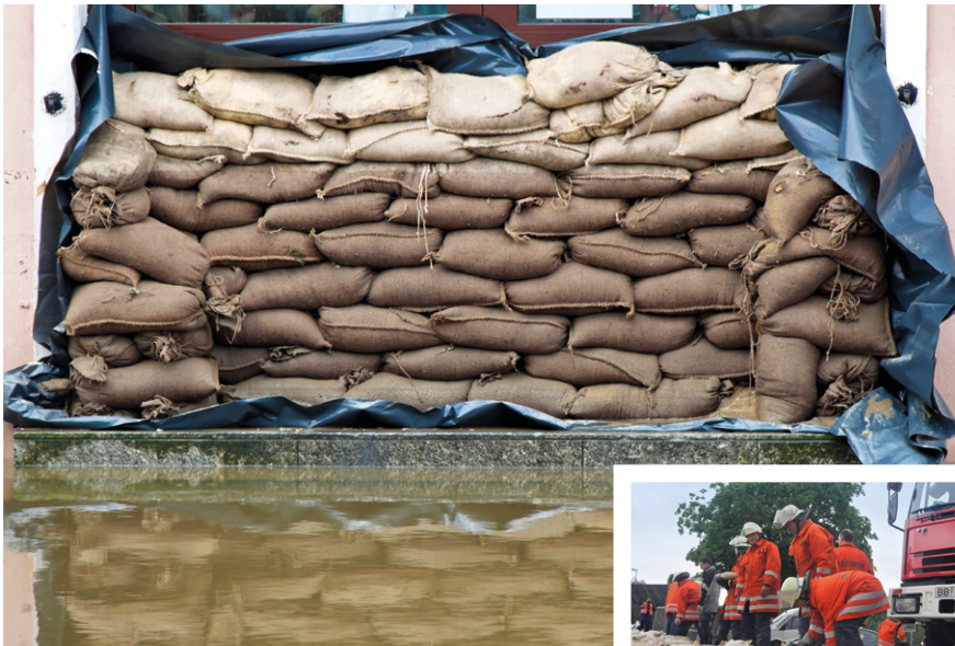
Protective walls of sandbags