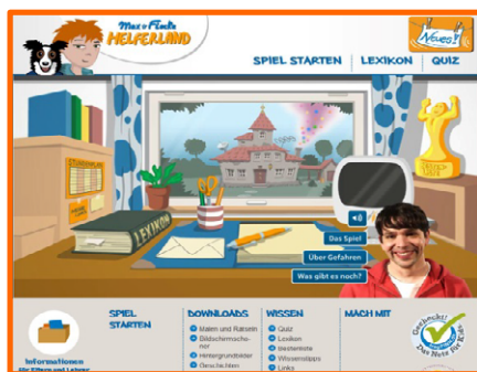
Homepage of www.max-und-flocke-helferland.de

The BBK provides this website to familiarise children between the ages of 7 and 12 with the dangers of everyday life. Here, children can learn how to deal with everyday dangers through an adventure game, find stories and pictures for colouring in related to the topic of civil protection, test their knowledge in a quiz and find many other useful things to download.