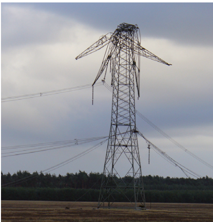
Storm damage caused by Hurricane Kyrill in 2007