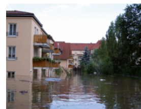
Flooding in the town