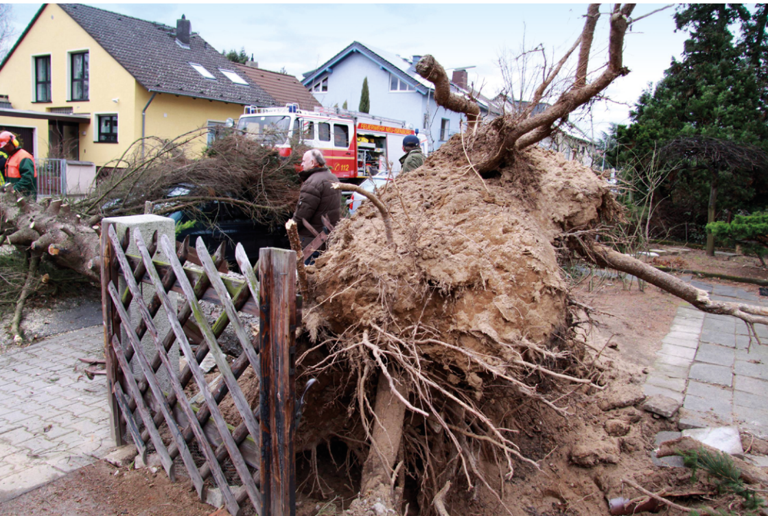
Cyclone Xynthia caused dangerous gale force winds in Hesse, 2010