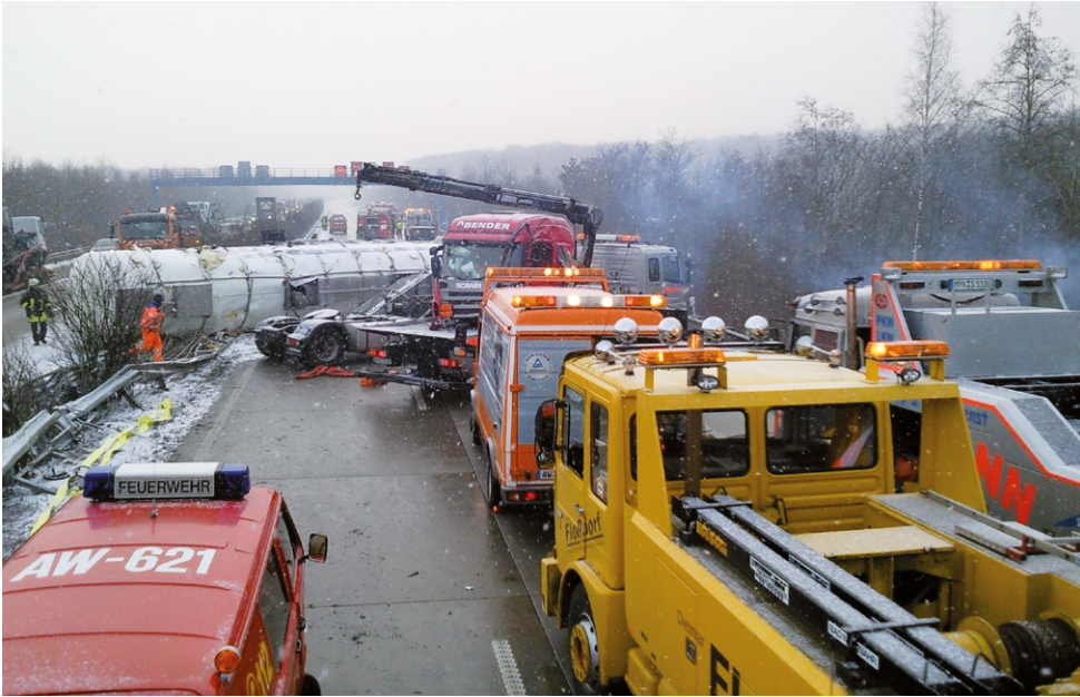
Serious accident of a dangerous goods HGV