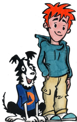
Max & Flocke accompany the children in Helferland.

The BBK provides this website to familiarise children between the ages of 7 and 12 with the dangers of everyday life. Here, children can learn how to deal with everyday dangers through an adventure game, find stories and pictures for colouring in related to the topic of civil protection, test their knowledge in a quiz and find many other useful things to download.