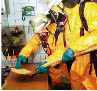
Firefighters during a, simulation of a laboratory accident in the Office of Criminal Investigation of the Land in Mainz, Rhineland-Palatinate, 2003