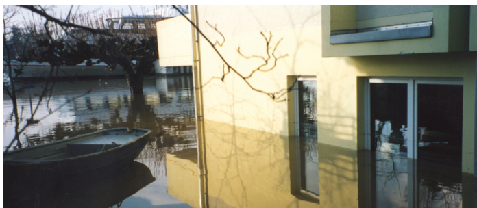
Flooding in Königswinter am Rhein