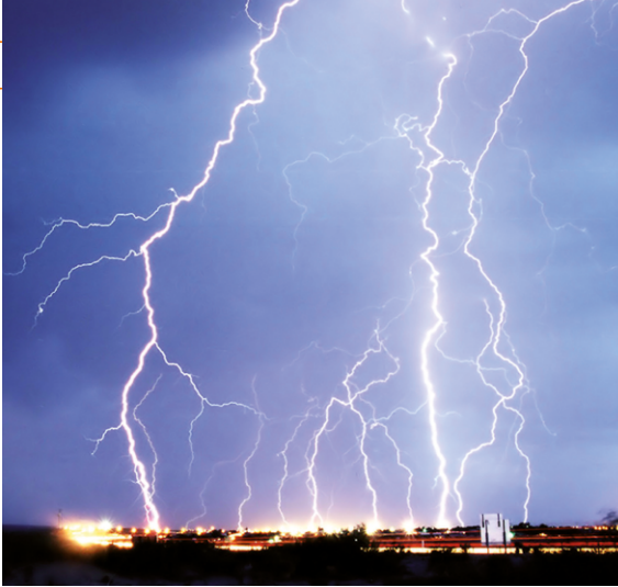
Lightning strike in a big city