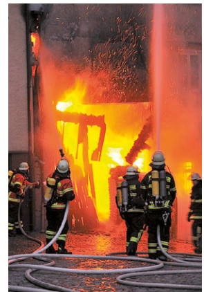
House fire in Monschau, North Rhine-Westphalia, 2008