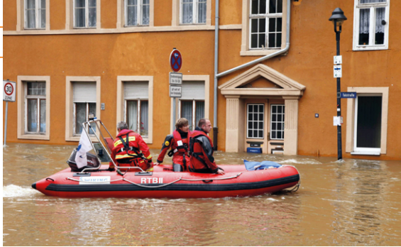
Rescue workers during the flood in Halle, Saxony-Anhalt, 2013